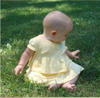
Rio discovering grass

INTERESTING THINGS FOR LIVING AND GIVING